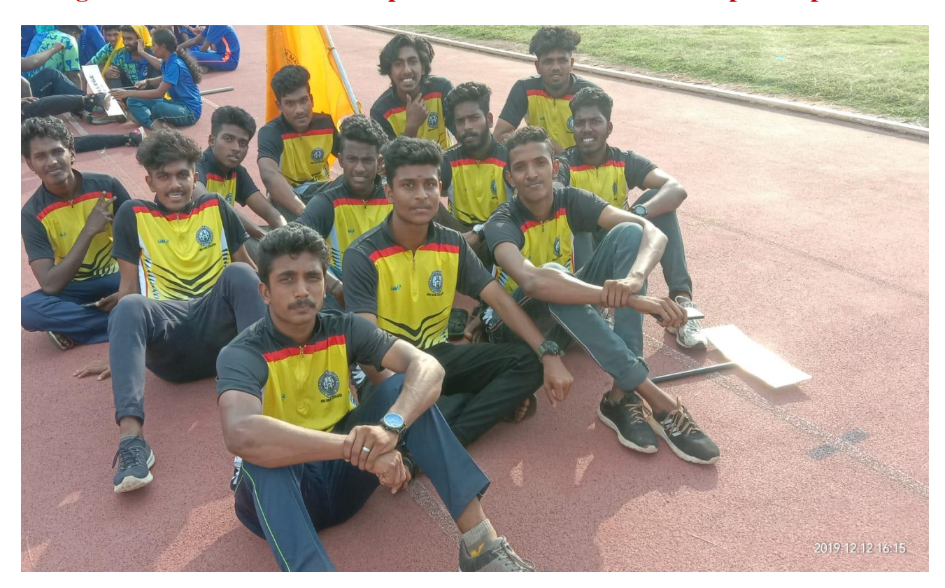
College Athletics Team (Men)