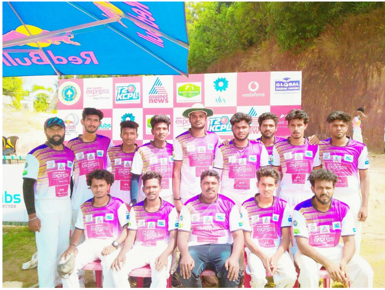
Cricket team participated in T20 KCPL Tournament