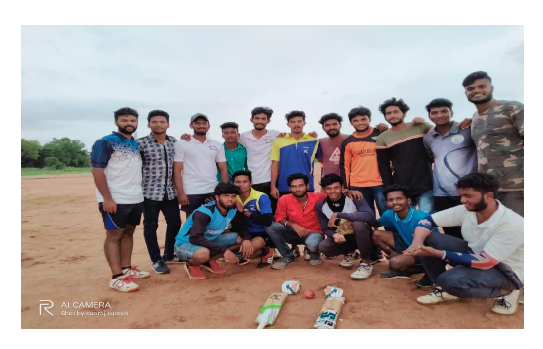
Cricket Coaching Camp