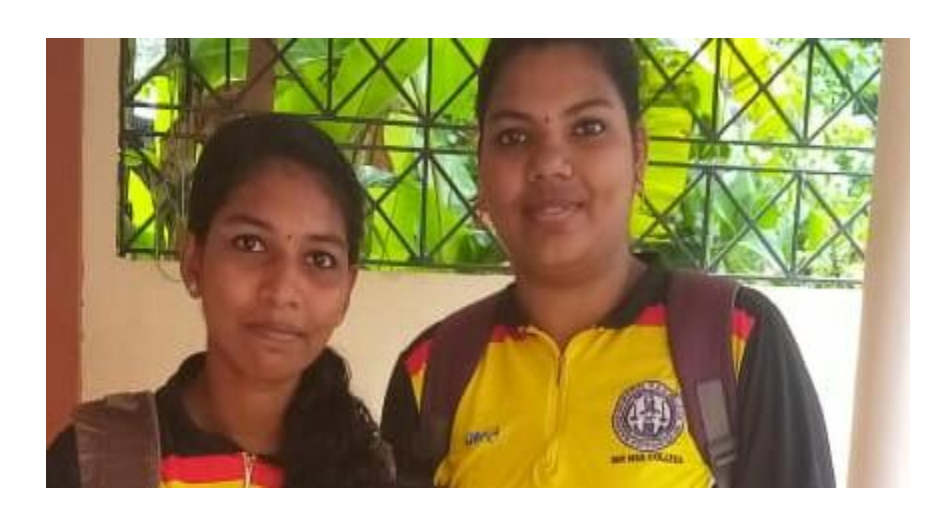
College Athletics Team (Women)