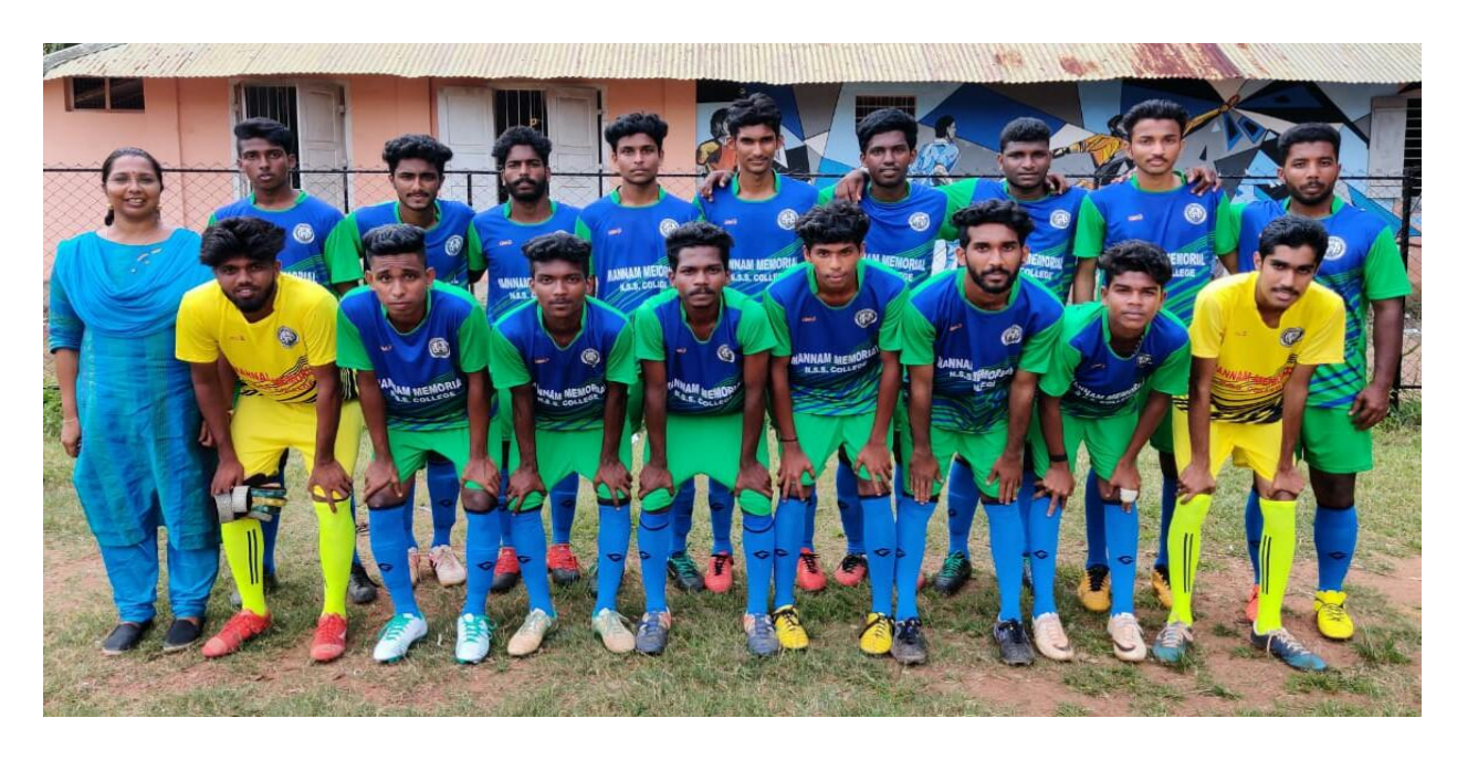
College Football team –Runner up in Don Bosco Football Championship