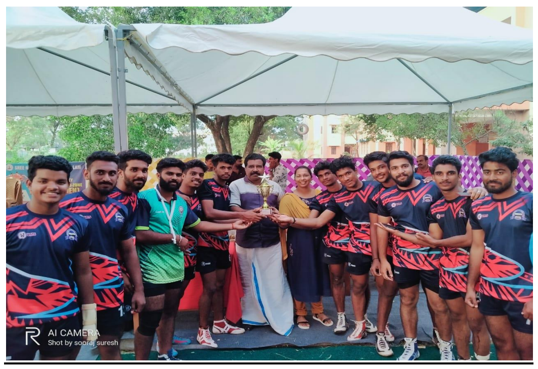
College Kabaddi Team

Kerala University Intercollegiate 2<sup>nd</sup> Runner –up