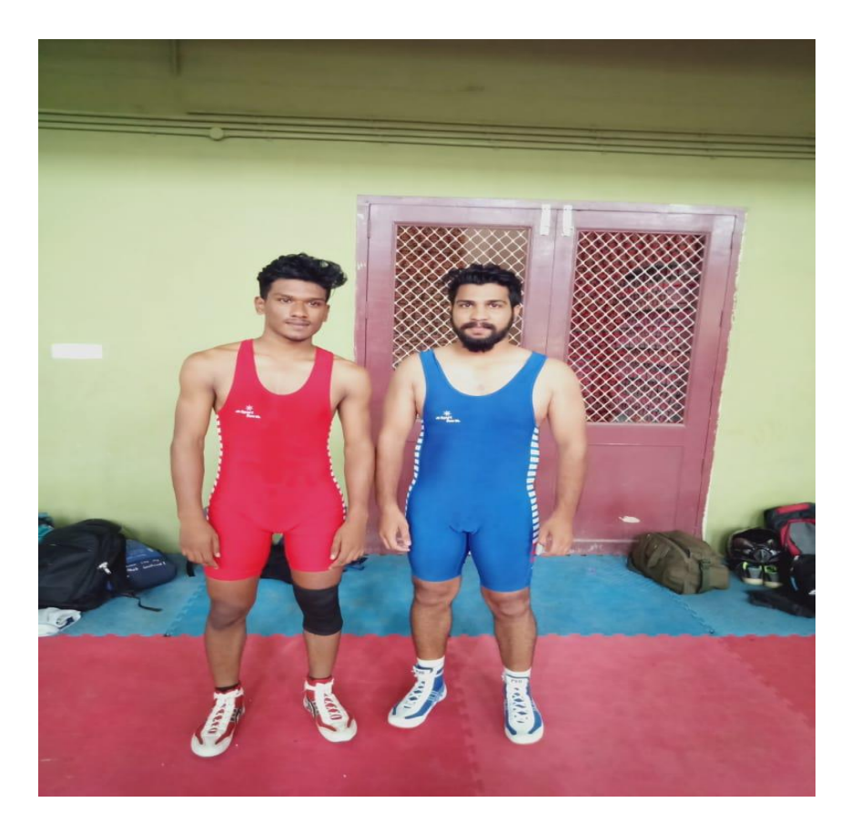
College Wrestling Team